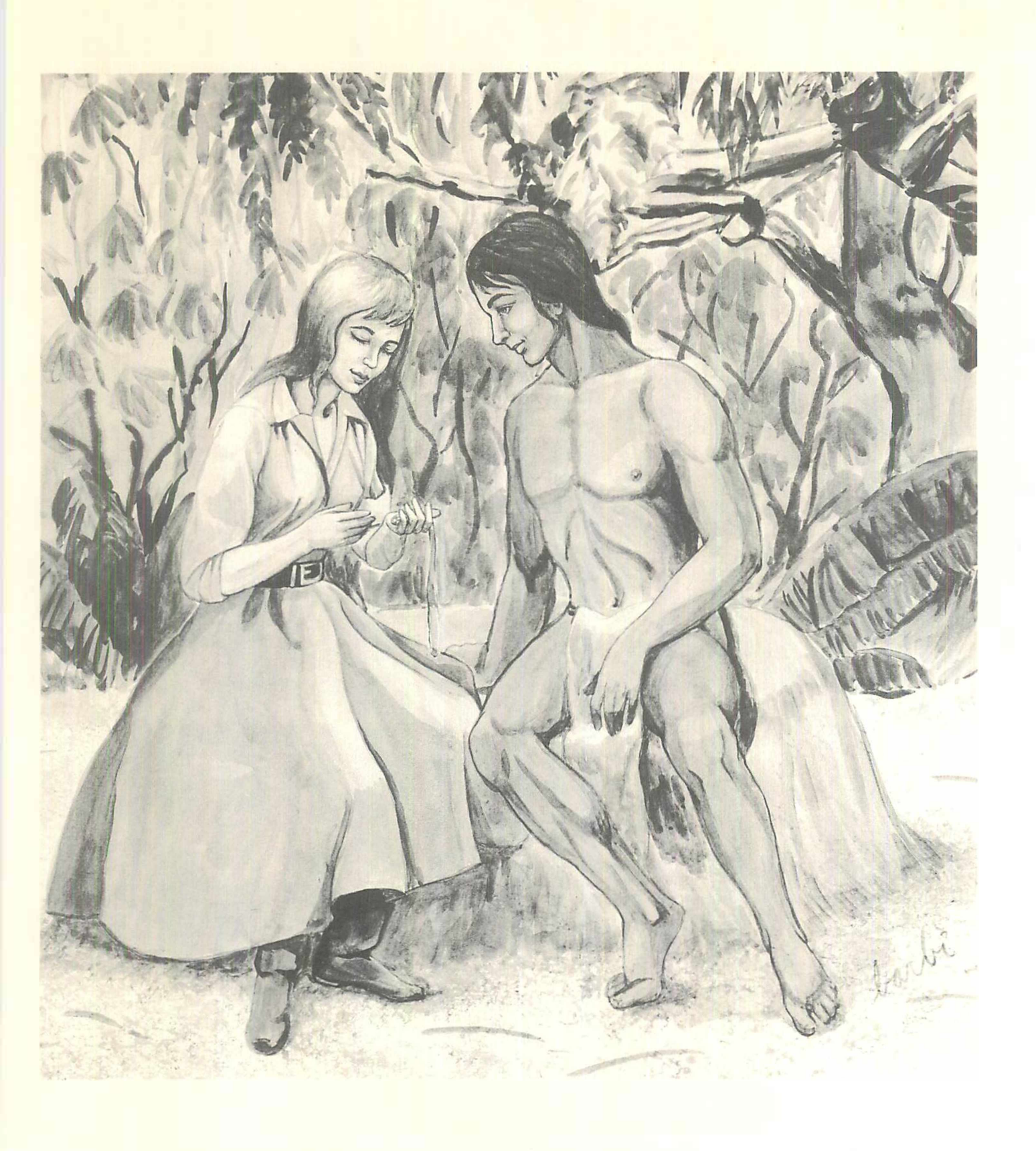
EDGAR RICE BURROUGHS' TARZAN OF THE APES GOLDEN ANNIVERSARY OCTOBER 1912 - OCTOBER 1962